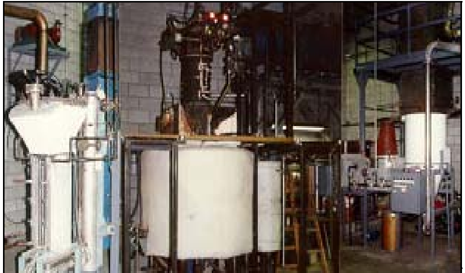
With $3.3 million in tax-exempt bond financing and a $750,000 loan, Procedyne Corporation was able to acquire and renovate its headquarters in New Brunswick and purchase new equipment to support its growth.

lighting, new street signs, sidewalks and sidewalk treatments, and trees and planter boxes – was financed through an innovative partnership that included $10 million in 30-year tax-exempt bonds issued by the EDA, underwritten by Wachovia Bank and carrying fixed interest rates ranging from 4.5% to 5.1%. The first phase of the three-year project encompassed the area immediately surrounding the Prudential Center, a major sports and entertainment venue that opened in 2007.