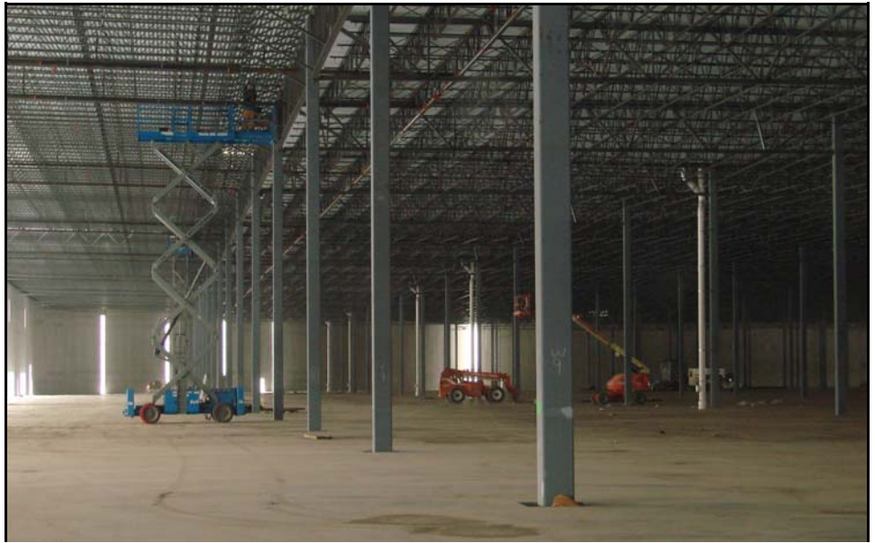
Panattoni Development Company's iPort 12 International Trade and Logistics Center in Carteret will be fully completed in April 2008 and is currently available for lease. iPort 12 is a 1.2 million-square-foot development located at Exit 12 of the New Jersey Turnpike. The project is one of the first to offer state-of-the-art warehousing and represents a success story for brownfields redevelopment as well.

Through the Portfields Initiative , the EDA continued to work with the Port Authority of New York and New Jersey, other state agencies and major private developers to transform underutilized sites within the Port District of New Jersey into modern warehousing and distribution centers. Several projects have moved forward. ProLogis has leased most of the 360,000 square feet it has developed in Wood-