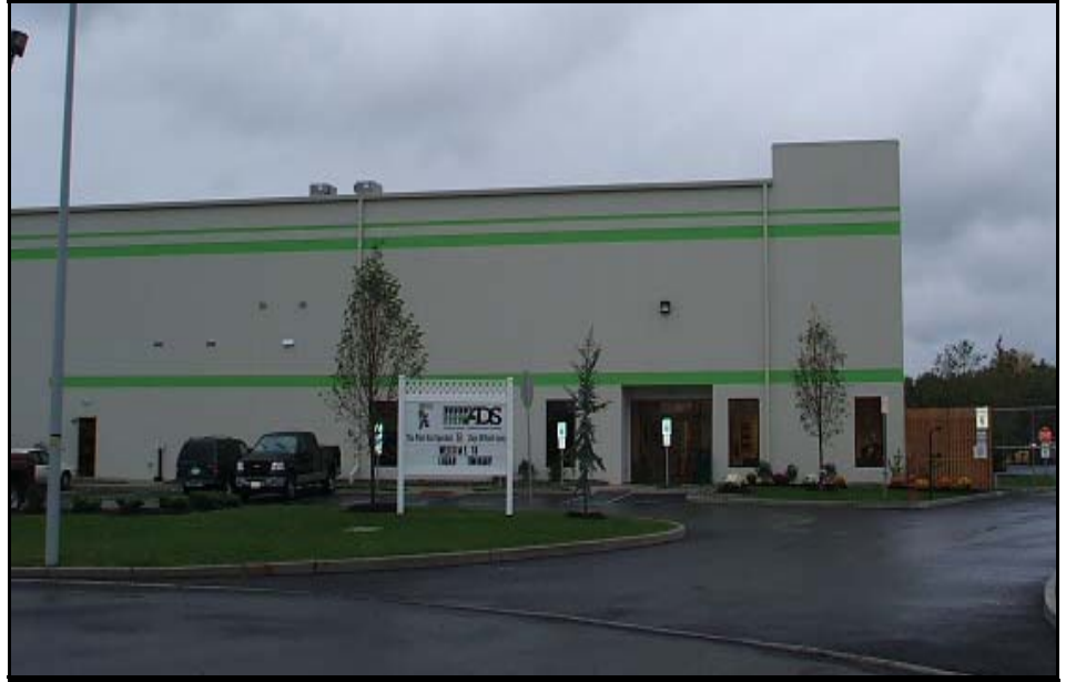
With $9 million in tax-exempt bond financing, Advanced Drainage Systems, Inc. was able to build its new plant in Logan Township.

When Novel Box Company, Ltd. wanted to relocate from Brooklyn to New Jersey to expand its jewelry-related manufacturing and wholesale business, the EDA issued $2.4 million in tax-