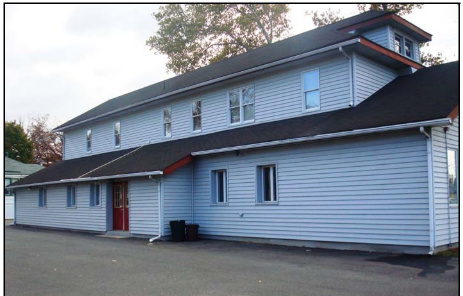
The Mental Health Association in Southwestern NJ used a $325,000 Commerce Bank loan with a $160,000 EDA participation to purchase this building in Haddon Heights. The new facility will enable the organization to relocate its facilities in Voorhees and Camden to one central location, resulting in major cost savings.

The Mental Health Association in Southwestern NJ also used a $325,000 Commerce Bank, N.A. loan with a $160,000 EDA participation to purchase a building in Haddon Heights to consolidate its Voorhees and Camden facilities. The organization serves Burlington, Camden and