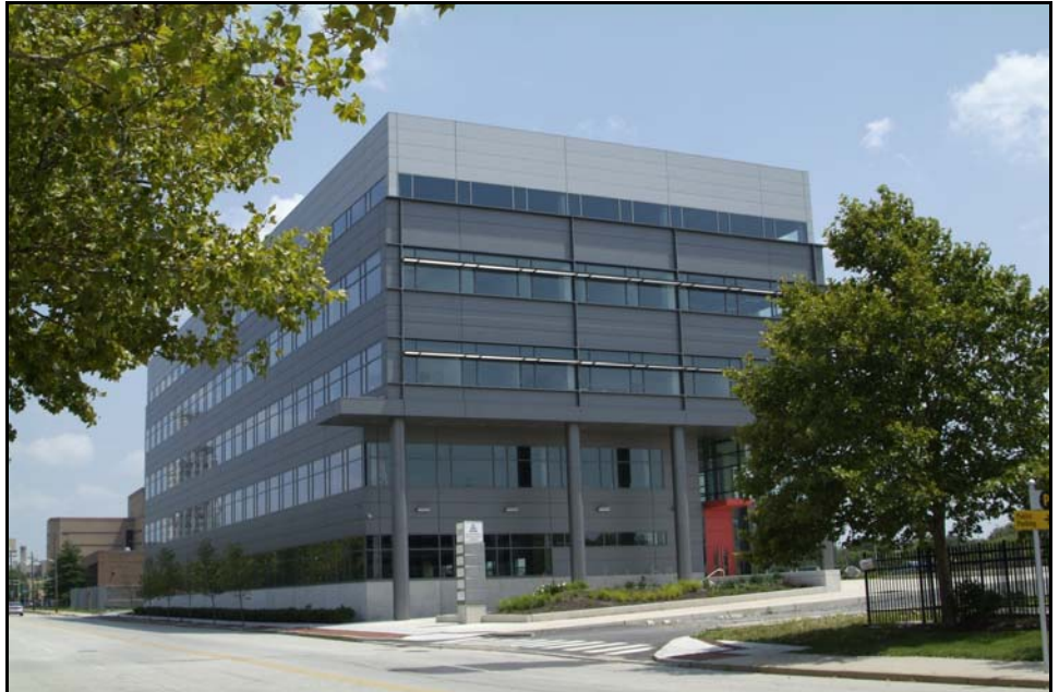
EDA's award-winning Waterfront Technology Center at Camden welcomed three new tenants in 2007 - Cooper Health System, Agilence, Inc. and myLEADERBOARD, Inc. Total employment at the Center is now well over 500.

These businesses joined Gestalt, Inc. , the ACIN (Applied Communications and Information Networking) Camden Center for Entrepreneurship in Technology operated by