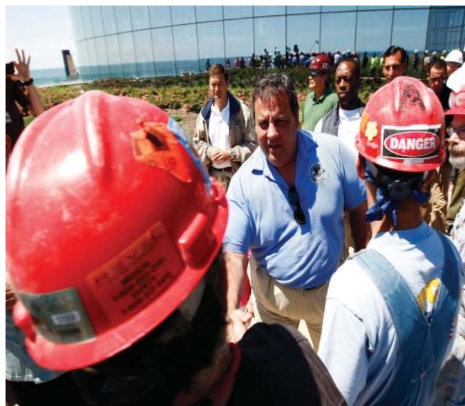
Governor Chris Christie greets construction workers during an August visit to Revel Atlantic City.

In August 2011, Saker ShopRites, Inc. became the second project to close under ERG. The new, 70,000-square-foot world-class ShopRite opened in Somerville in October 2011 with the help of $5 million over 20 years through ERG. This marked the Borough's first and only supermarket since Pathmark closed in 2007. The project is expected to create 300 new jobs, and 235 employees have been hired to date.