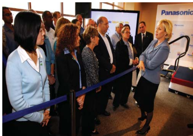
Lt. Governor Guadagno greets Panasonic employees at the October 2011 event announcing the company's decision to stay in New Jersey and build its new North American headquarters in Newark

The Teachers Village is located on both sides of Halsey Street, connecting the existing University Heights area with the Prudential Center and the rest of downtown Newark's existing core. Designed by world-renowned architect and Newark native Richard Meier, the project represents the first development phase in the SoMa Newark redevelopment plan, which consists of 12 square blocks and 15 million square feet of development in downtown Newark. The Teachers Village project is expected to create 450 construction jobs and 460 permanent jobs.