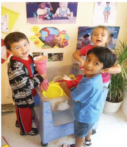
South Brunswick Family YMCA

The South Brunswick Family YMCA benefited from $2.25 million in tax-exempt bond financing, which will allow the not-for-profit organization to refinance existing debt and undertake a roof replacement capital project. The community and family-centered organization runs a childcare facility, summer camps, and after school programs. The facility boasts a teaching pool, dance studio and fitness center, and offers a wide range of programs, including parent/tot gymnastics classes and classes for seniors. The bonds were directly purchased by EDA Premier Lender TD Bank.