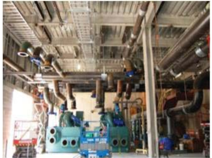
NRG Thermal's Energy Center at the new University Medical Center of Princeton at Plainsboro. The hospital is expected to open in May 2012.

With an anticipated opening of May 2012, the new University Medical Center of Princeton at Plainsboro will be among the most sustainable hospitals in New Jersey due, in part, to an on-site Energy Center NRG Thermal is developing. The Energy Center will be comprised of a central utility plant, CHP facility, and a thermal energy storage system, supplying 100 percent of the hospital's heating and cooling needs. The project will reduce the hospital's energy bill and greenhouse gas emissions, as well as increase reliability. NRG Thermal received a $1.9 million grant to establish the 4.6 megawatt CHP facility. NRG Thermal is a subsidiary of NRG Energy, Inc., a Princeton-based Fortune 500 company that owns and operates one of the country's largest power generation portfolios. NRG will operate the Energy Center for the hospital. The project is expected to create nearly 300 construction jobs.