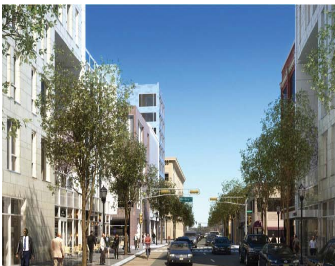
A rendering of Teachers Village in downtown Newark.

Supported by both ERG and UTHTC, the $124.3 million Teachers Village is a catalytic redevelopment project moving forward in downtown Newark. The project, being developed by RBH Group, is a 368,993-square-foot development that will include eight low-rise, mixed-use buildings that cover five city blocks. Teachers Village will consist of 224 rental residential units, pre-marketed to Newark teachers; three charter schools and a daycare center totaling 100,000 square feet; and, 70,000 square feet of retail. The project consists of environmentally-conscious, LEED-certified design and construction, and will also include a health club, dry cleaner, café, parking, and shops. The project was approved for up to $20.5 million for up to 20 years under ERG and up to $39.45 million under UTHTC.