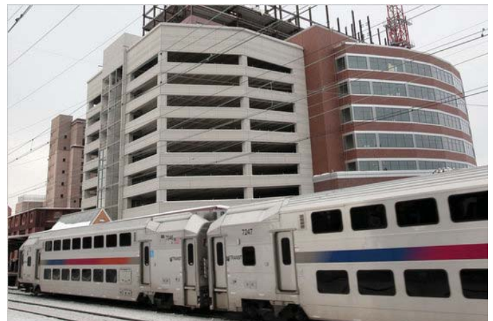
View of the Gateway Transit Village from the westbound train platform of the New Brunswick Train Station.

The Gateway project was a 2011 finalist for the highly coveted “Deal of the Year Awards,” sponsored by the New Jersey Chapter of NAIOP, the commercial real estate development association. It was ultimately rewarded with a Meritorious Recognition Award.