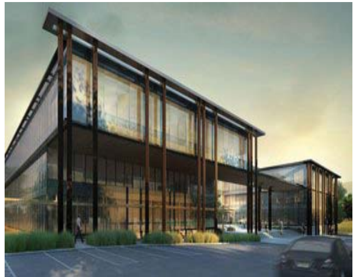
An artist's rendering of the Realogy Corp.'s future headquarters at 175 Park Ave. in Madison. Courtesy of The Hampshire Companies.

Biomeasure Inc. , a U.S.-based subsidiary of Ipsen, announced in December 2011 that the company will relocate its U.S. headquarters from Brisbane, California to Bridgewater, New Jersey. The company expects to begin operating from its new 30,000-square-foot facility by April 2012. To encourage the company to locate in New Jersey, EDA approved a BEIP grant worth an estimated $4.47 million over 10 years based on the creation of 91 new, high-wage positions. Based in Paris, France, Ipsen is a global biopharmaceutical specialty care group.