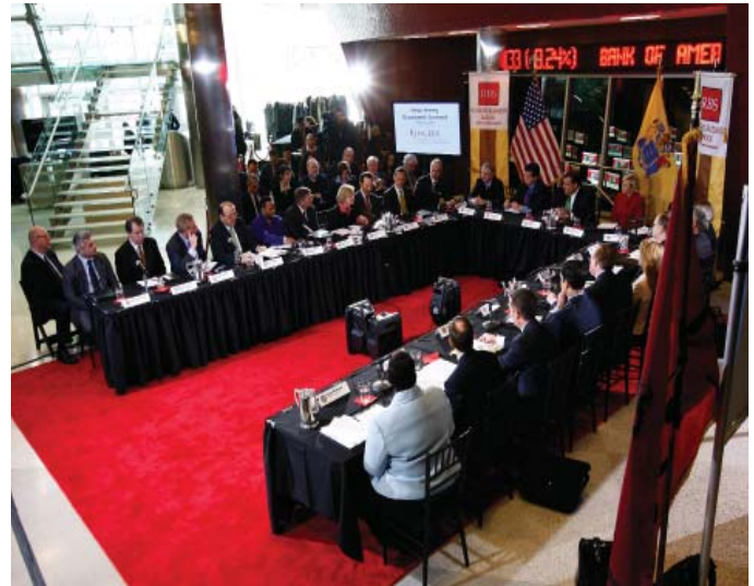
The Partnership for Action team joined Governor Chris Christie and Lt. Governor Kim Guadagno at the February 2011 New Jersey Economic Summit, a roundtable discussion with business leaders from across the state at Rutgers Business School in Newark.

The expansion of the Business Retention and Relocation Assistance Grant (BRRAG) and Urban Transit Hub Tax Credit programs were particularly critical to New Jersey's ability to retain companies and jobs in the state, and encourage major investment in our cities. In tandem with administering the still powerful Business Employment Incentive Program (BEIP), the transformational Economic Redevelopment and Growth (ERG) program, and various lending programs, the EDA has enthusiastically continued its role as the state's "bank for business" to encourage economic development and job creation.